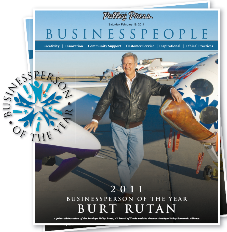
2011 Winner, Burt Rutan

Nominate the businessperson of your choice today!